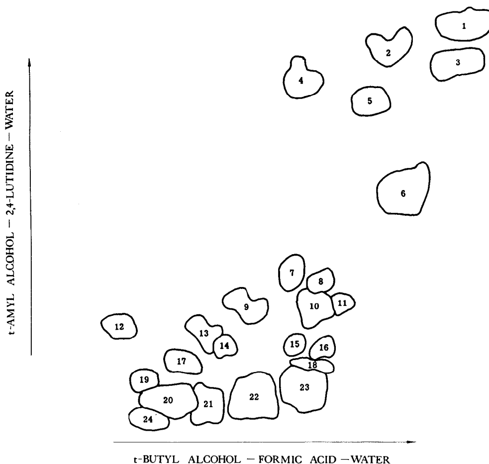
Fig. 1. Two-dimensional descending paper chromatogram of the free amino acids in Wedgewood iris bulbs developed with 0.25 per cent ninhydrin in acetone: (1) leucine, (2) phenylalanine, (3) isoleucine, (4) tyrosine, (5) methionine, (6) valine, (7) ethanolamine, (8) proline, (9) threonine, (10) alanine, (11) \beta -aminoisobutyric acid, (12) histidine, (13) serine, (14) glycine, (15) \beta -alanine, (16) \gamma -aminobutyric acid, (17) glutamine, (18) unknown, (19) asparagine, (20) arginine, (21) aspartic acid, (22) glutamic acid, (23) \alpha -amino adipic acid, (24) lysine.