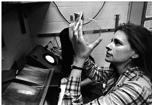
FIGURE 2. Lucy Shapiro (1972) at the Albert Einstein College of Medicine.